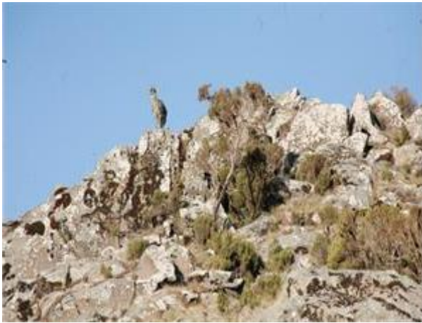
(c) (d) (e) (f) (g) (h)

Figure 4. Partial view and large endemic mammals of the Bale Mountains National Park; (a) & (b) Landscape of the park, (c) Klipspringer, (d) Ethiopian wolf, (e) Giant mole rat, (f) Mountain nyala and warthog, (g) Menelik bushbuck, (h) Bale monkey (Photo by Alemneh Amare, 2014; EWCA (d)).